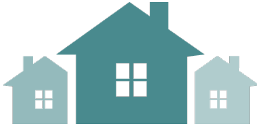
Transition and Sustaining Supports